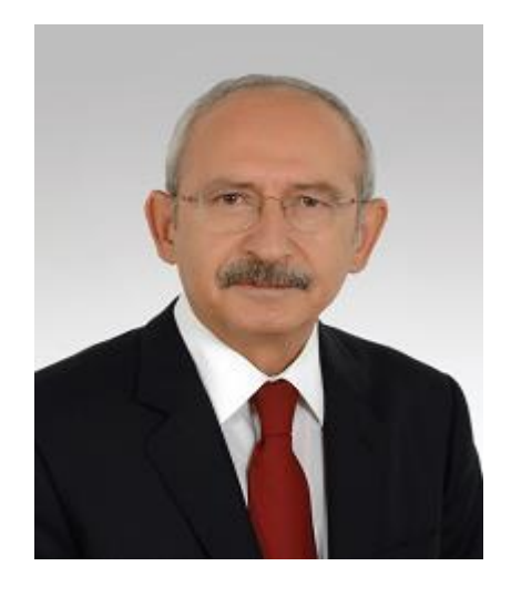
Re-elected President of CHP Kemal Kilicdaroglu

- February 3<sup>rd</sup>, Kemal Kılıcdaroglu was re-elected as the chairman of main opposition Republican People's Party (Cumhuriyet Halk Partisi - CHP) at the party's 36th general congress this weekend ahead of three crucial elections in 2019. Kılıcdaroglu, who has led the party since 2010, was the front-runner for party chairmanship in the congress. A total of 790 delegates voted for Kılıcdaroglu, while the other candidate, Yalova Deputy Muharrem Ince, received 447 votes. Some 1253 delegates out of 1266 cast their votes. Ince for chairmanship Kılıcdaroglu in the party's 2014 congress, in which 740 delegates voted for Kılıcdaroglu and 415 for Ince. Former Istanbul Bar Association Umit Kocasakal and Omer Faruk Head Eminagaoglu, former Head of the Judges and Prosecutors Association, have also announced their candidacies for the party chairmanship, but they could not collect the required number of signatures. Kılıcdaroglu has been criticized from his party members as he has lost the national vote eight times in elections and referendums since taking office in 2010, after the resignation of former Chairman Deniz Baykal. (www.dailysabah.com)