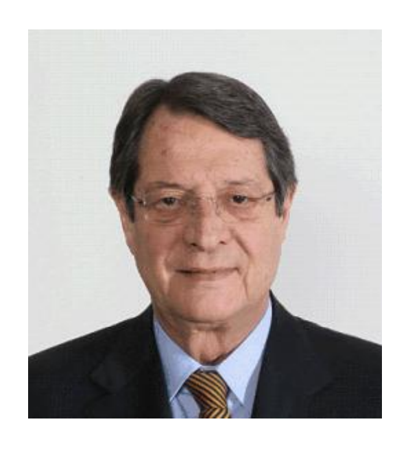
Cypriot President Nicos Anastasiades

- February 4<sup>th</sup>, Incumbent Nicos Anastasiades was re-elected as Cyprus President in the second round of the elections with 55.99% of the vote, giving Progressive Party of Working People (Ανορθωτικό Κόμμα Εργαζόμενου Λαού – AKEL)-backed independent Stavros Mala 44.01%. Overall turnout, reached 73.97% slightly higher than that of the first round, but lower by almost seven points than the turnout for the 2013 presidential runoff. Malas conceded his defeat and congratulated Anastasiades. Everyone must work