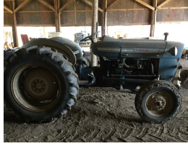
tach shows 6305