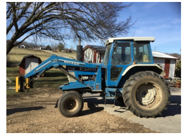
Ford 7710 diesel tractor, 97 hp, 4 cyl, 4-way hydraulics, cab, 5122 hrs on tach, w/Koyker K5 loader, one owner