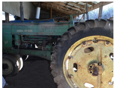
1953 John Deere 50, 33hp