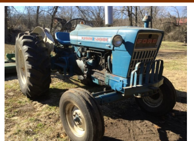
Ford 5000 diesel tractor, 52 hp, Ford 2000 tractor, 36 hp, 4-way hydraulics, tach shows 5725 hrs