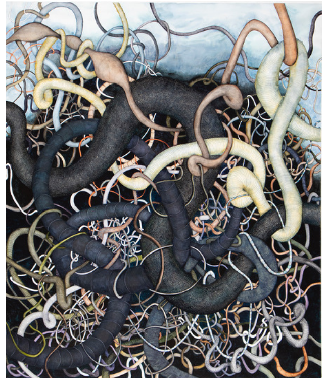
Left: A Few Were Quite Loud , 2018, watercolor & mixed media on wooden panel, 36 x 36 in. Right: Down the Rabbit Hole , 2018, watercolor & mixed media on paper, 46 x 40 in. 48 x 41 in. framed