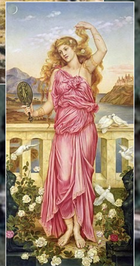
Helen of Troy by Evelyn De Morgan