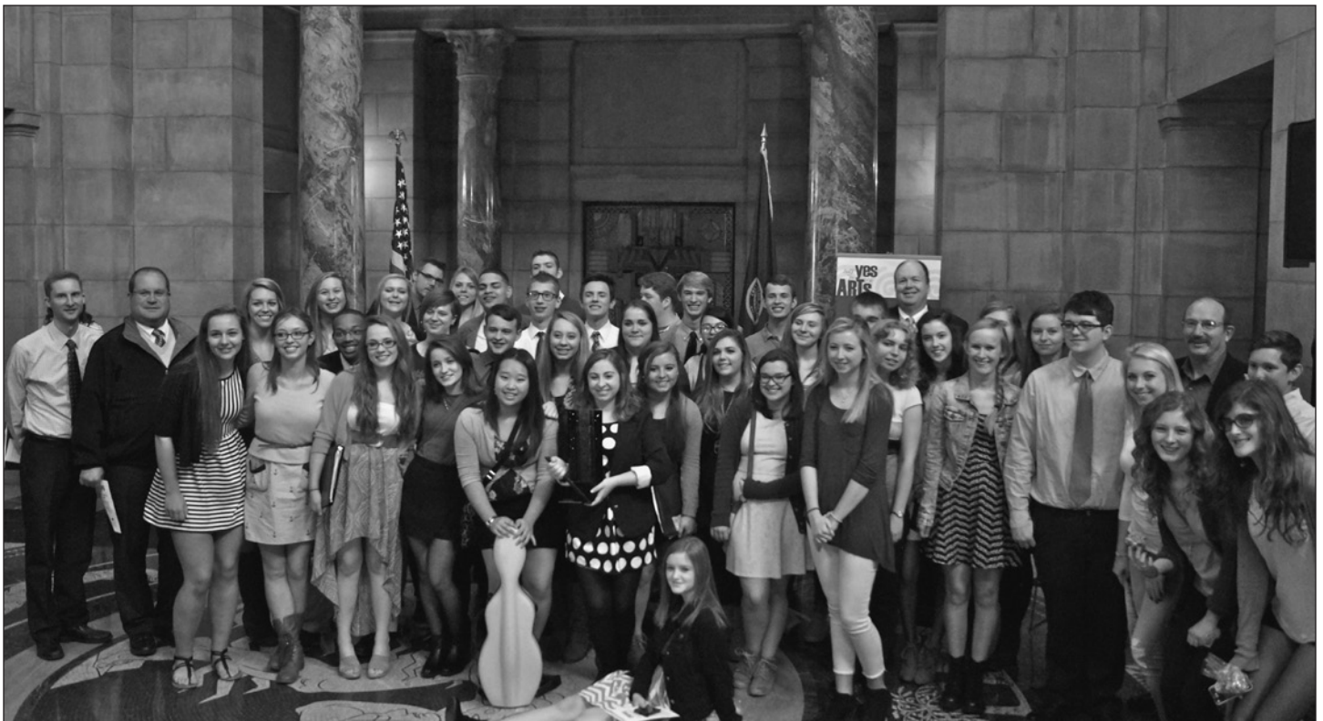
Westside students and faculty pose with the 2014 NebraskARTS award.