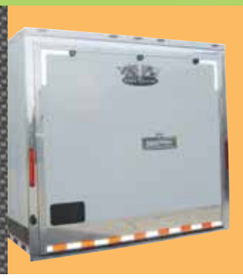
Single Handle Recessed Latch Ramp Door with L.E.D. Taillights.