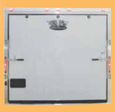
Double Cambar Locks with L.E.D. Taillights.

The Bandit is a great entry-level trailer. It has the same high quality construction of our higher lines, and includes 1" x 1 ½" box tubing, 16" on center floor, walls, and ceiling construction.