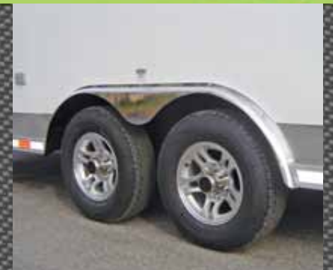
Standard Aluminum Wheels with Polished Fenders.