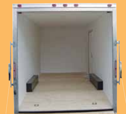
Standard with Finished Interior White Vinyl Walls and Ceiling with 3/4" Plywood Floor.