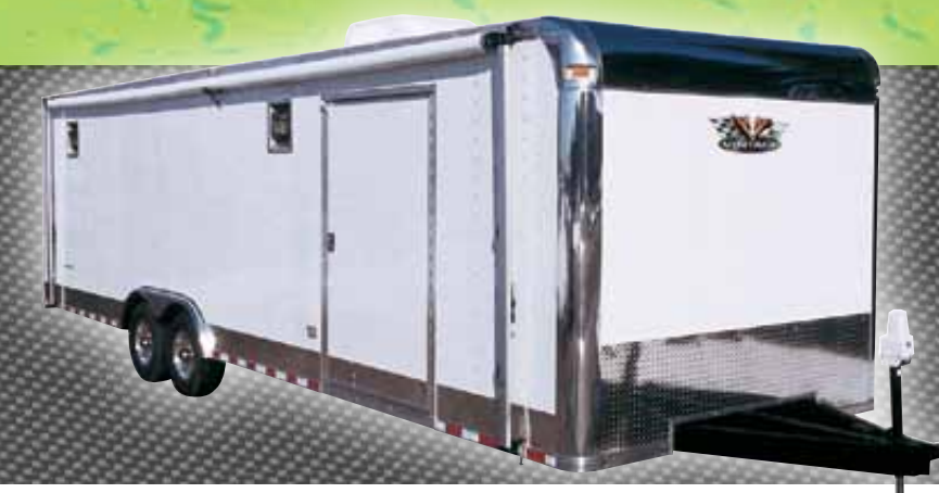
Available in TAG or Gooseneck Models .

Known for its sleek look, the Intimidator turns heads as it rolls down the highway or sits at the track. This model has a bull-nose front and brite anodized radius corners with polished cast aluminum caps and a brite anodized skirt. The ceiling is insulated, and it has a single-handle recessed latch on the ramp door.