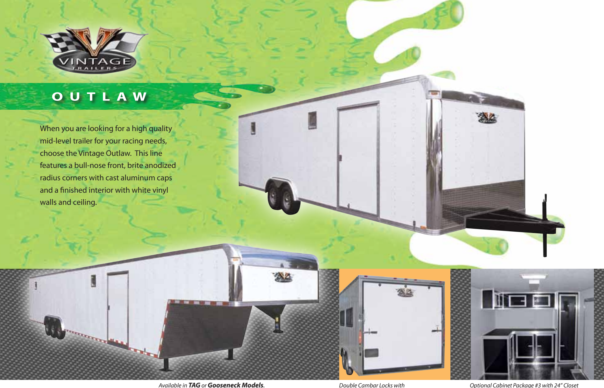
Double Cambar Locks with L.E.D. Taillights.