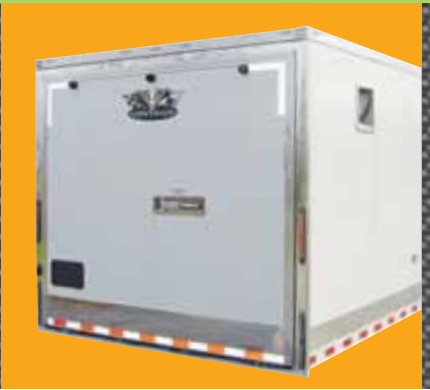
Single Handle Recessed Latch.