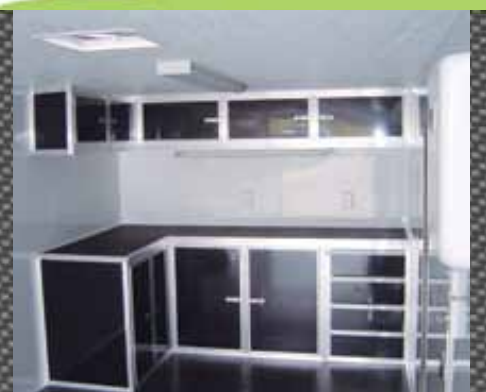
Optional "Elite" Cabinet Package #2 with Drawers.

Our anniversary smooth side, the Crystal SS, is truly the complete package in race trailers. These models feature a .040" exterior metal smooth side, exclusive lighting package including two 500 watt recessed quartz lights, and over 13 other special features unlike any other trailer in its class. From the unparalleled Vintage frame quality to the attention to detail in every corner, the Crystal SS defines everything today's racer wants.