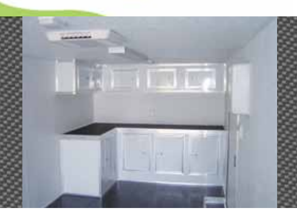
Optional Cabinet Package #2.