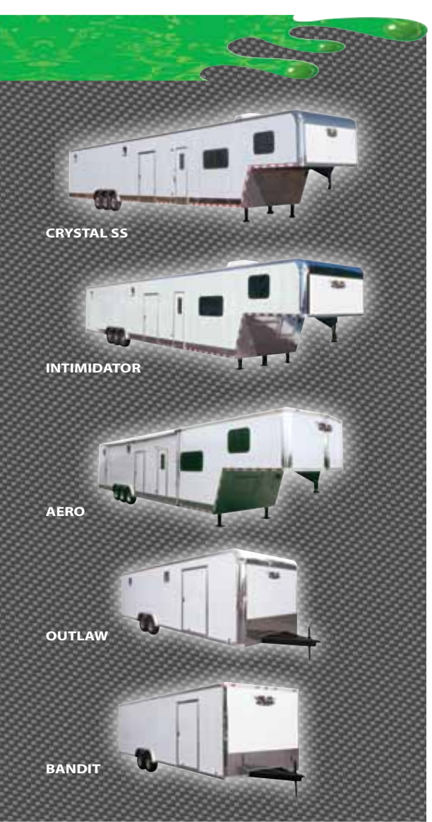
Your Vintage Professional: