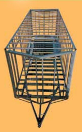
All Vintage Trailers are Constructed 16" on Center with 1"x 1-1/2" Box Tube Sidewalls.