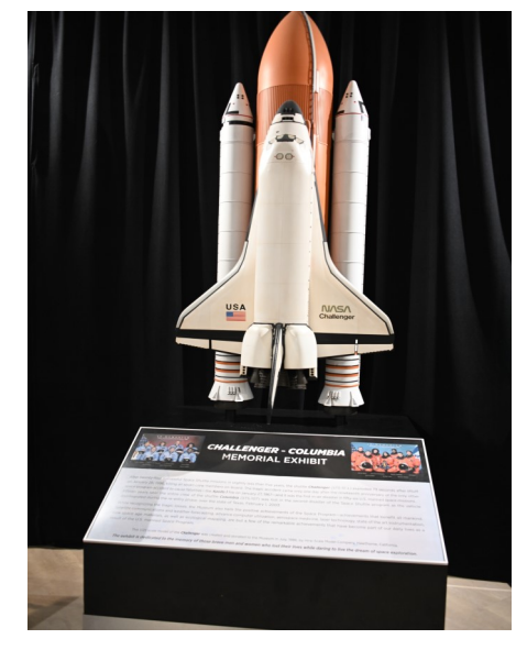
Tribute to the crews of the Challanger and the Columbia