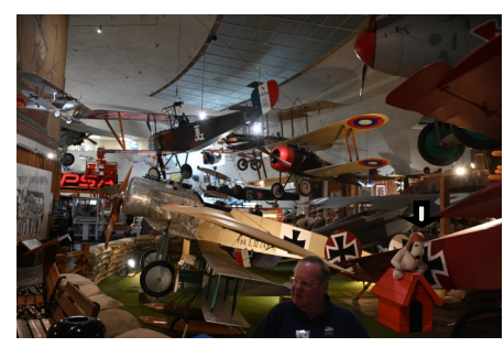
What a dogfight from WWI-literally