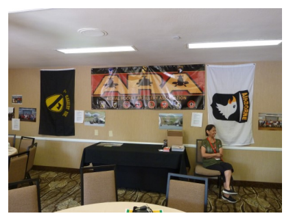
Rachel Castillo adds a charming touch to the décor of the Hospitality Suite