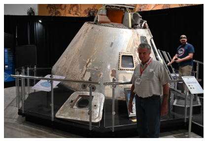
What is a medic doing in the Apollo Command module?