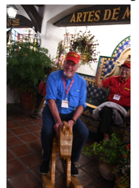
Grandpa Mobley rides again!