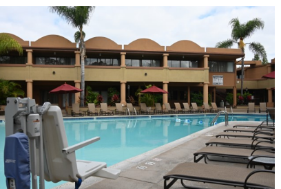
This beautiful concrete pond was the entrance to the Hospitality Suite