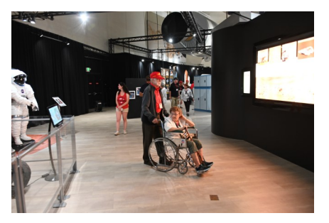
The Museum Rover