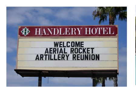
It's nice to be wanted!