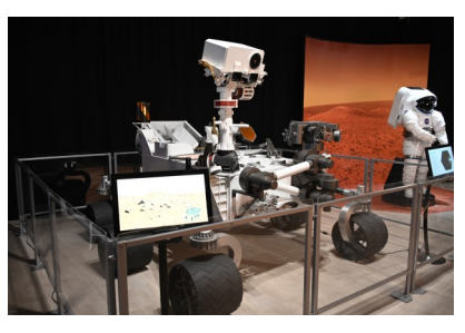
The Moon Rover