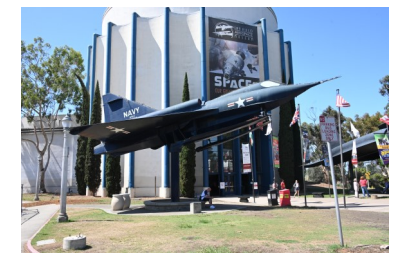
Navy's first and only attempt at a water landing capable jet.