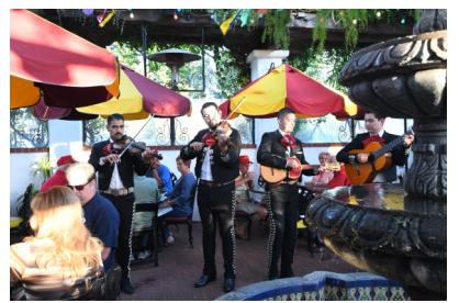
Serenaded by a Mariachi band at the Casa Guadalajara restaurant and Welcome Dinner. The violin