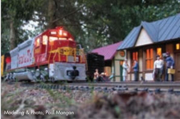
Modeling & Photo, Paul Mangan