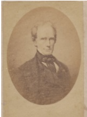
Andrew Jackson (1767-1845)

Clay regards Jackson's executions at St. Marks and his seizure of Pensacola as "acts of war," carried out in rogue fashion by the General without authorization from Congress, as required in the Constitution.