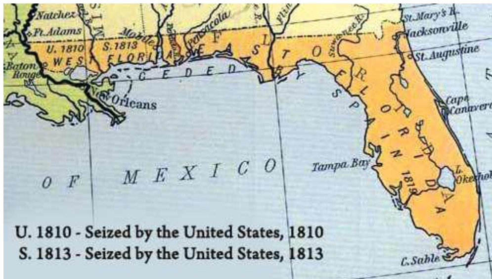
American Seizures of the two Floridas

Jefferson argues that West Florida is actually a part of its 1803 acquisition from France, and Madison supports the 1810 takeover of Baton Rouge. He then orders American troops to secure control over all of West Florida in 1813.