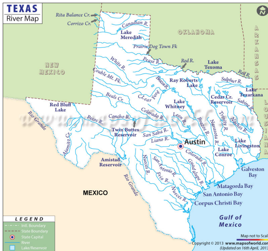
The Disputed Province of Tejas/Texas

Disputes on this have surfaced repeatedly since Napoleon's 1803 sale – and Adams and Onis begin negotiations far apart on their claims. Adams argues that American land should extend to the Rio Grande River, thus encompassing the province of Tejas. Onis counters by asserting that the proper boundary should be far east, at the Mississippi River.