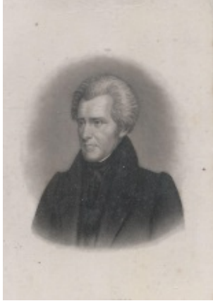
Andrew Jackson (1767-1845)

This ends Jackson's ten week rampage across northern Florida.