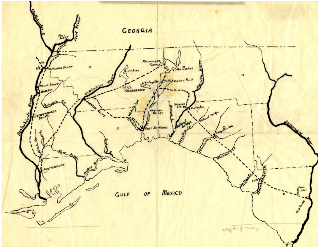
Map of General Andrew Jackson's Florida Incursion in 1818 from the Apalachicola (left) to the Suwannee Rivers (right)

General Jackson of course has won national fame during the War of 1812 with his landmark victories at Horseshoe Bend and New Orleans, so he is well accustomed to leading troops into action.