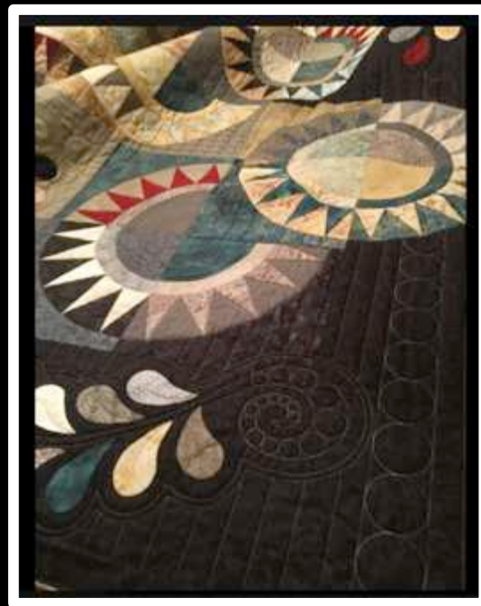
“New York Radiance” 88” x 107”