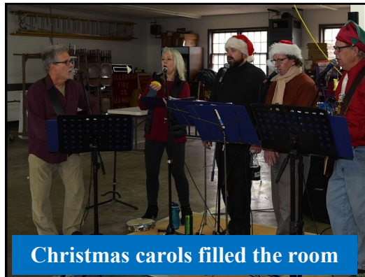
Christmas carols filled the room