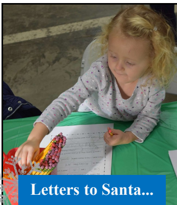
Letters to Santa...