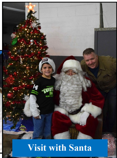
Visit with Santa