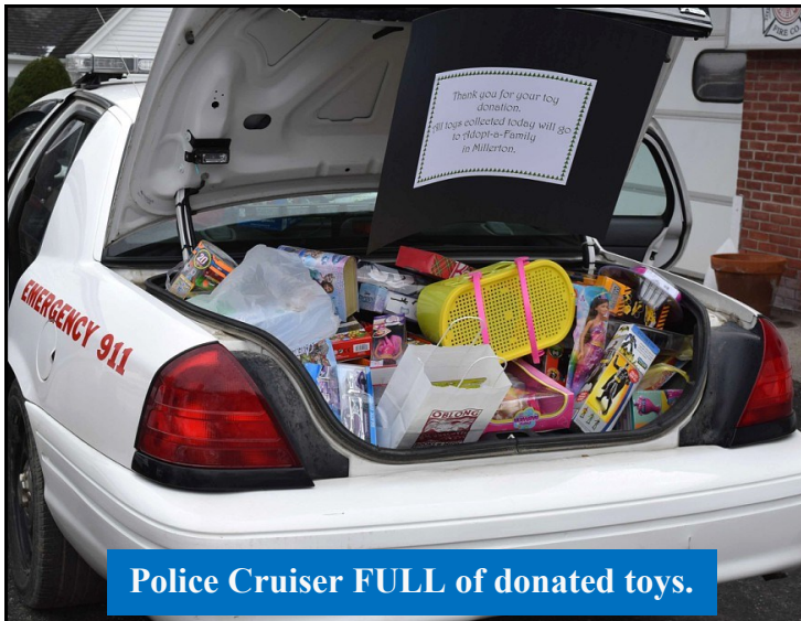
Police Cruiser FULL of donated toys.