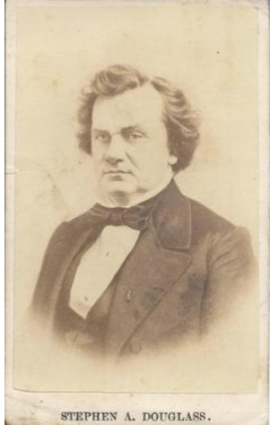
STEPHEN A. DOUGLASS. Stephen Douglas (1813-1861)

Clay's departure does not end the need for some resolution in Congress over the admission of California and the search for "off-sets" that are tolerable to the South.