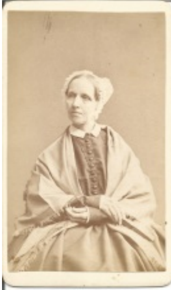
Living the Contemplative Ideal

While some movements seek to reform society, others decide to opt out of it.