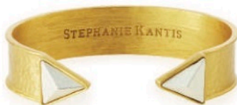
Women's Silver Trio Triangle Cuff Bracelet $385