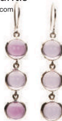
Charmed Circle $150