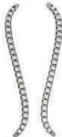
Nitya Chandra $350