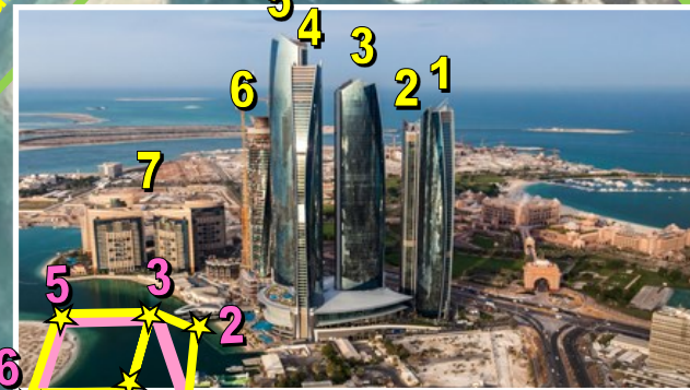
Pleiades Pattern Reversed PYRAMID CITY

The Emirates Palace has a 333° heading as does the Cydonia complex and the inclination of the Abu Dhabi is at an approximate 45 degree angle. The only variation that occurs with the Cydonia Pleiades pyramid complex is that the 'Pyramid City' is in front of the Emirates Palace. There are 5 prominent towers called the Jumeirah al Etihad Towers and 2 other lesser structures but all the same very impressive and beautiful architecture. These 5 towers suggest the pentagram that is also incorporated into the Pleiades pyramid city on Mars.