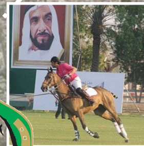
Golf & Equestrian Club