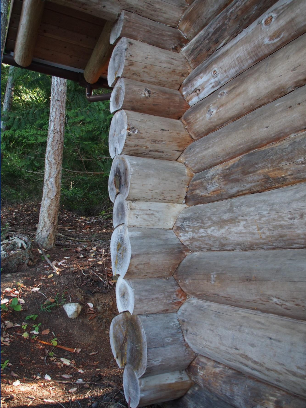
Northwest Corner (facing West) Logwork after 20 Years