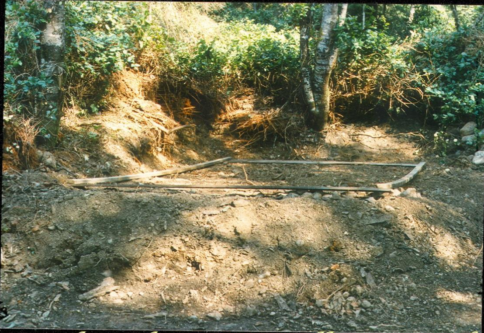
Located ~15 ft. Diagonally From House