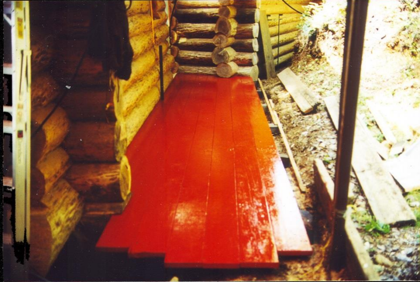
Back Porch Freshly Painted North Side (Looking West)