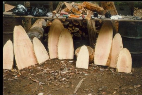
Top Logs Shaped To Roof Line Using Alaska Mill