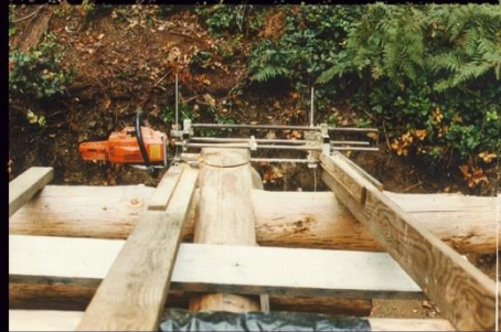
Shaping The Wall Timbers And Cross Beams To Conform To The Roof Line Set At The Width Of A 2 x 4 On End (Above The Top Wall Log)