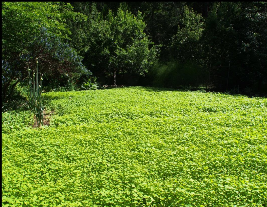
Buckwheat Early Summer