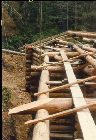
Looking East (North Side)