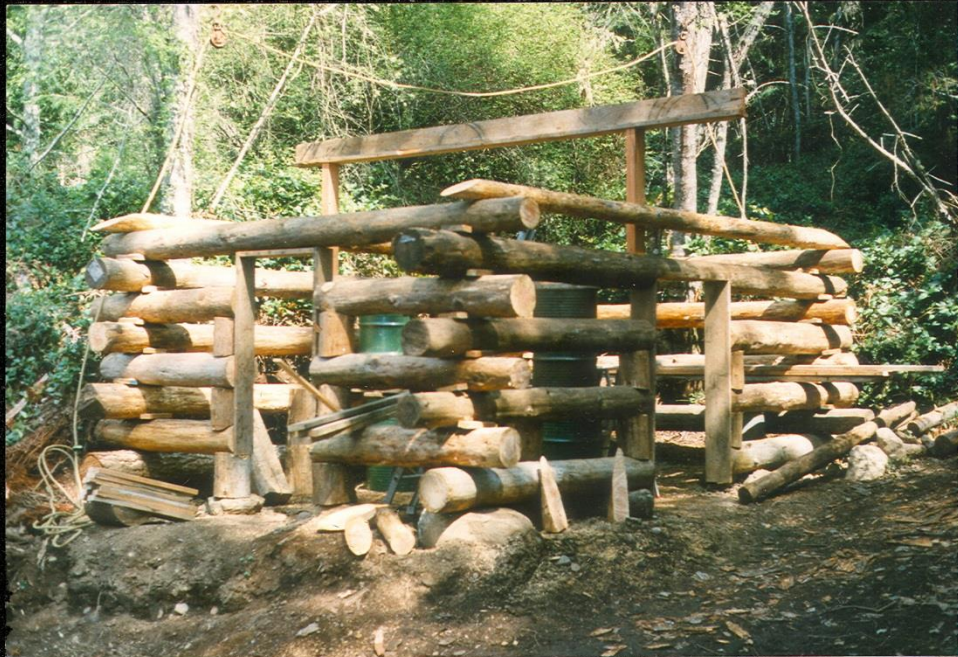
Constructed From Log House Remnants