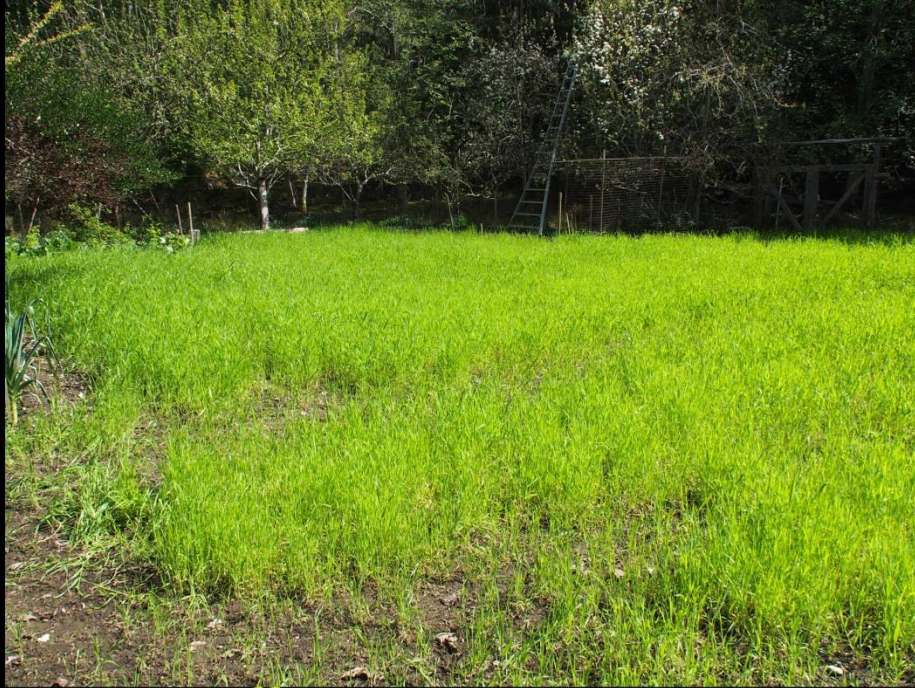
Fall Rye Springtime