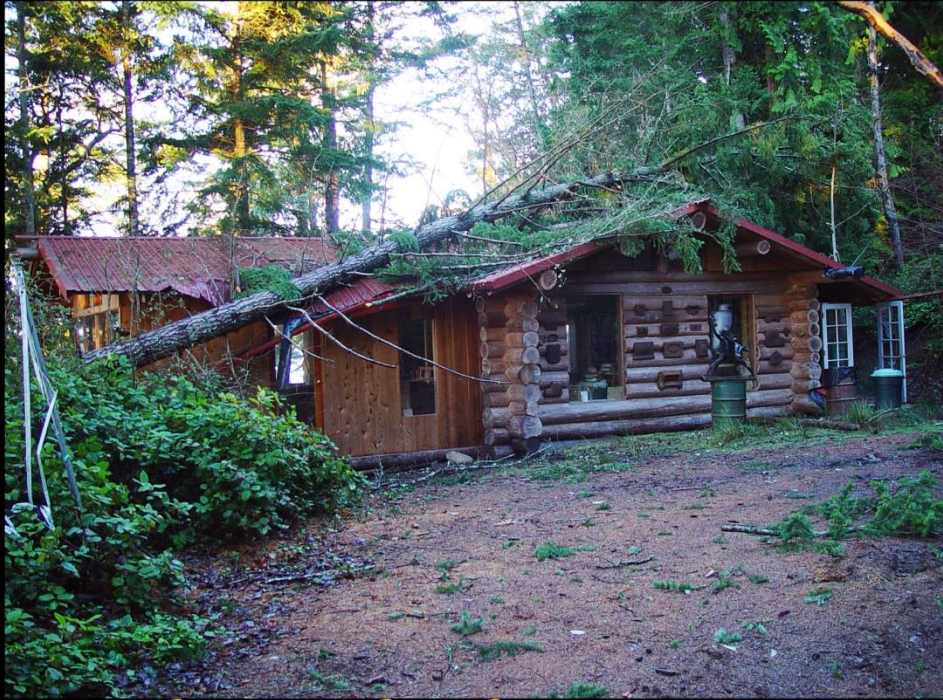
Southwesterly Blows One Down