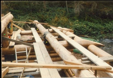
looking East (South Side)