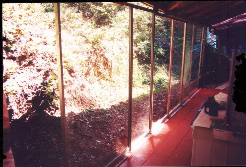
Back Porch Glazed Looking East