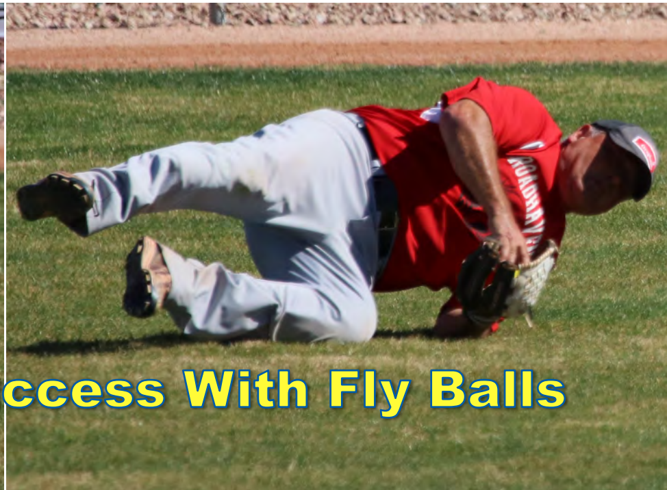
Geezers Do Have Success With Fly Balls