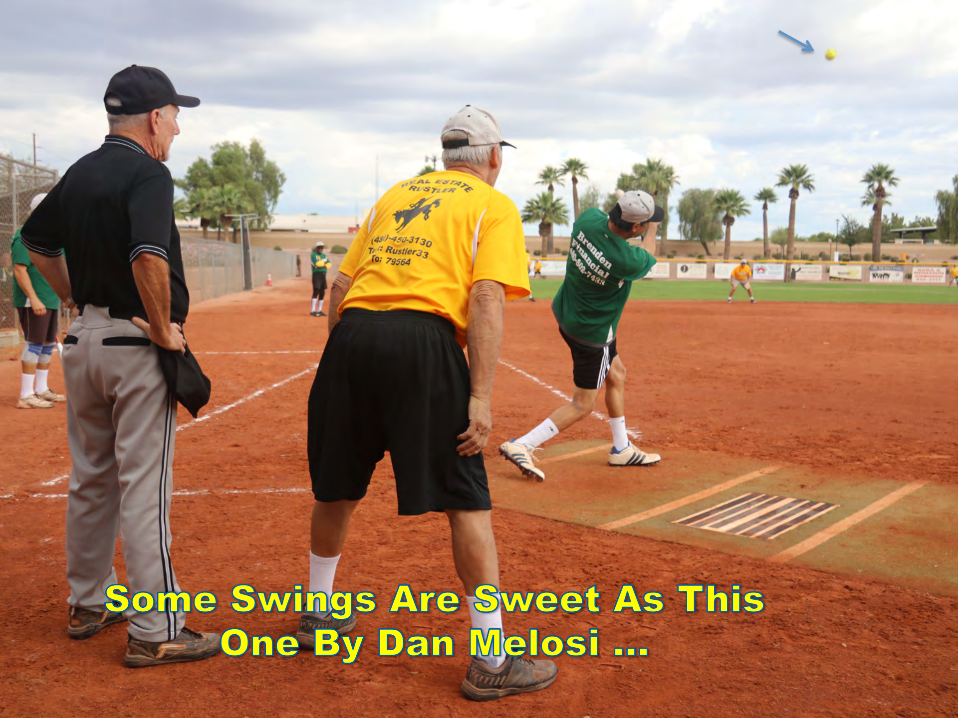
Some Swings Are Sweet As This One By Dan Melosi ...