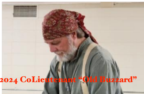
2024 CoLientenant "Old Buzzard"