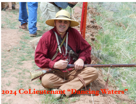
2024 CoLientenant "Dancing Waters"