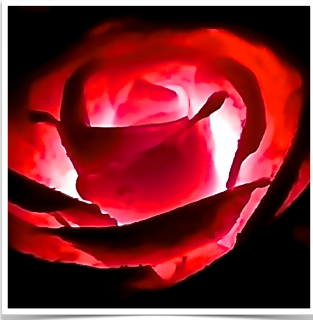
Smokin' Toes red hot metallic rose!!!

Ron Mann will be printing targets with the shared printer (FLMLC & etc.). Cost of the ink cartridge will be fairly divided among those who use the printer. Cost of the card stock will be borne by each user individually. Subheading