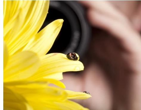
Photo must be a single print/digital image. Collages and collections of photos are not accepted. Entrant must be the photographer and may use a variety of digital editing techniques including but not limited to, multiple exposure, negative sandwich and photogram.