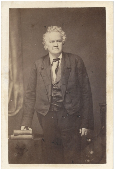
Joshua Giddings (1795-1864)

Even before Taylor is inaugurated, the slavery issue flares up again in Congress.