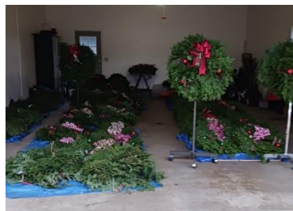
Decorated wreaths awaiting pick up.