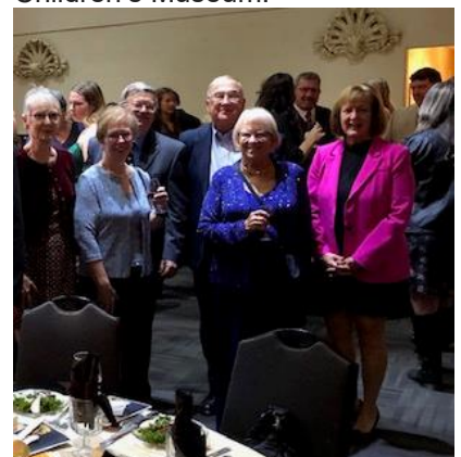
A few GFWC members (and 2 spouses) at the M&M Children's Gala.

The Museum is currently offering a 2025 Calendar Raffle. The price is $25 per ticket for 52 total drawings. Drawings will be every Friday at noon at 425 1st Street Menominee. Each drawing prize is $250 and you need not be present to win. All winners will be re-entered into subsequent drawing. Only 1,000 tickets are sold, I will have these at our December 4th meeting. They make great Christmas gifts! Thank you to each and every one of you for supporting the M&M Children's Museum!