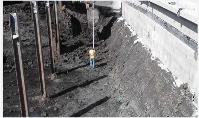
Excavation after the removal of soil