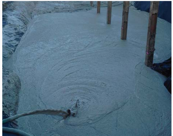
Placement of pervious cellular lightweight concrete fill at the Rose Coulee Bridge