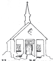
Holloway Memorial Chapel Founded in 1891