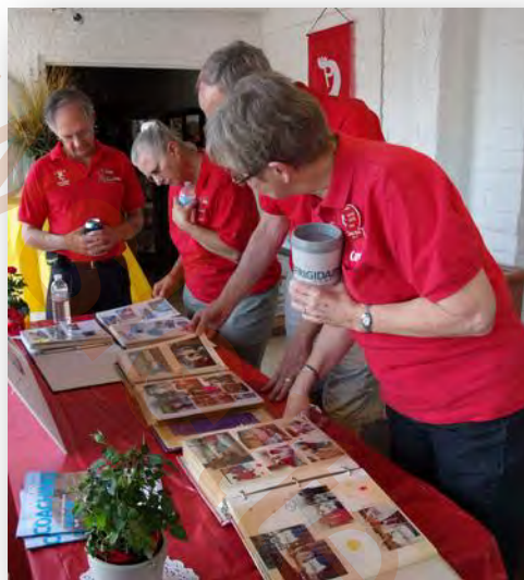
It's fun to look at the Club's scrapbooks.