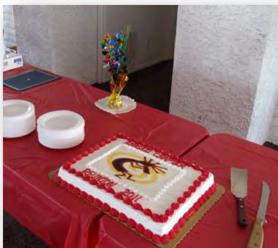
Our special "Reunion" cake.