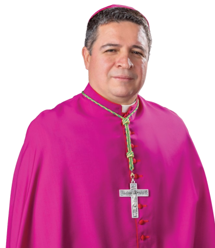
The Most Reverend Evelio Menjivar-Ayala

To read the full press release on the appointment of Bishop Menjivar, please visit dwc.org .