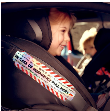
ROTH ID Tag

TAGS are free for Sheridan residents, $8.00 each for non-residents. For older children no longer in car seats, travelers tags are also available for $20.00 for non-residents and $10.00 for residents. They can be picked up at Village Hall during business hours. For more information, contact Cathy at Village Hall~815-496-2251.