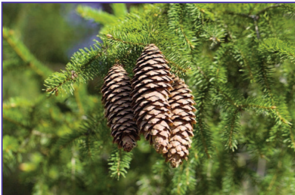
Figure 1 – Pine cones of a Norwegian spruce

Perhaps there are many varieties of firs and spruces, and a forestry expert is required to clarify this point. Meier's photos show at least four independent trees: Photos # 840 to # 844 show a tree whose crown has at least 4 diagonal branches, plus a long vertical crown. Its trunk is wide and straight.