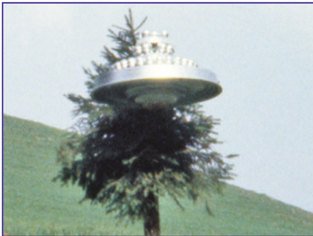
Figure 2 - Detail photo # 841. It has a straight and wide trunk.

Perhaps there are many varieties of firs and spruces, and a forestry expert is required to clarify this point. Meier's photos show at least four independent trees: Photos # 840 to # 844 show a tree whose crown has at least 4 diagonal branches, plus a long vertical crown. Its trunk is wide and straight.