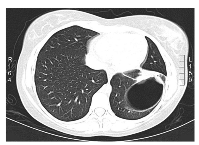
Fig. 1. A CT-scan showing a cystic lesion within the left lower lobe.