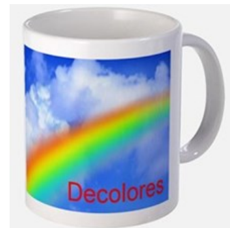
Sings the Rooster