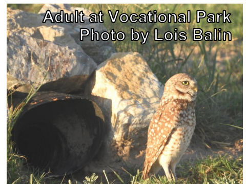
Adult at Vocational Park

Many thanks to El Paso City Parks, Creosote Collaborative, High Desert Native Plants, and the Master Naturalists for your support.