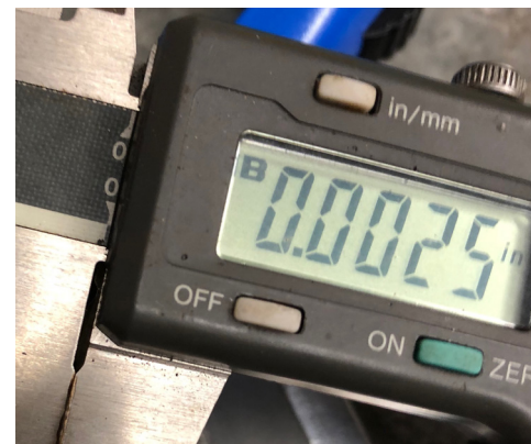
Verifying shim thickness