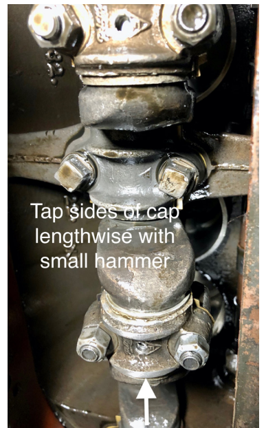
Tap sides of cap lengthwise with small hammer

Check the fitted cap again, when securely tightened with the nuts. Gently tap the edges of the cap with a small brass mallet as you place a finger on the other end of the cap to feel any movement. A snug cap will only barely move with a tap of the mallet and should not wiggle or move freely with such a slight tap. . . . .