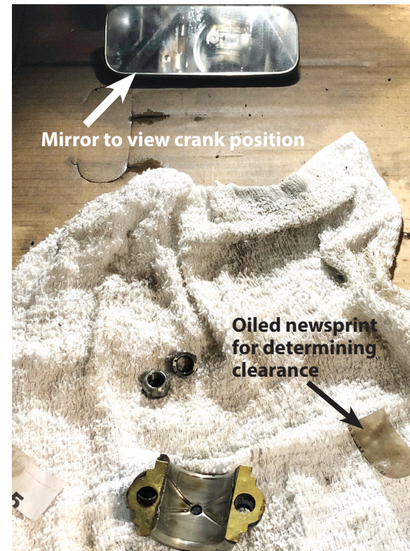
Mirror and oiled paper

Re-fit the cap with the thinned stack of shims and test for good clearance. One simple way to do this is to place a single sheet of newsprint, cut to nest into the lower cap. Oil the paper, then replace and tighten the cap nuts. Try to turn the crankshaft over. If the thin, oiled paper prevents the crankshaft from turning with the hand crank, then you know the shimming is correct. Remove the paper, then replace and tighten the cap. This should allow the crank to turn, with the rod cap clearance now being the thickness of the newsprint. Always use a fresh oiled piece of paper for each rod cap.