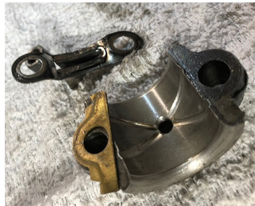
Cap removed, showing babbitt bearing

Once a cap is removed, check the bearing surfaces. In the photo above, the babbitt was in good condition with full contact surface wear. This cap was loose enough to easily finger push, so only tightening was needed.