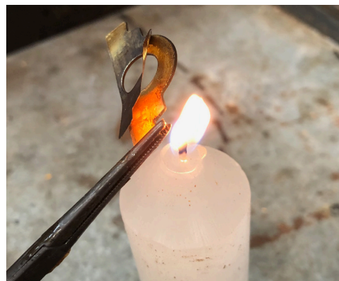
Using a flame to loosen a shim layer

Normally only one shim layer on each side of the cap is removed. Use a micrometer to check the thickness of a single shim, which will typically be .0025 in.