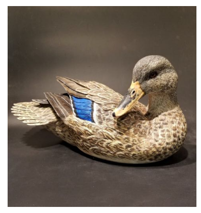
Full Detail Preening Mallard Hen