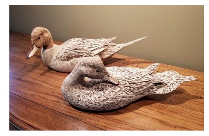
Wood Burned Full Detail Pintail Pair