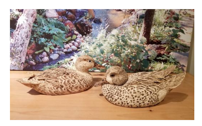
Wood Burned Full Detail Blue Wing Teal Pair