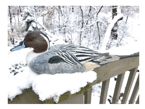
Full Detail Pintail Drake