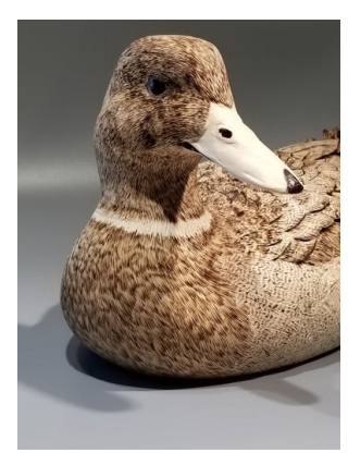
Wood Burned Full Detail Mallard Drake