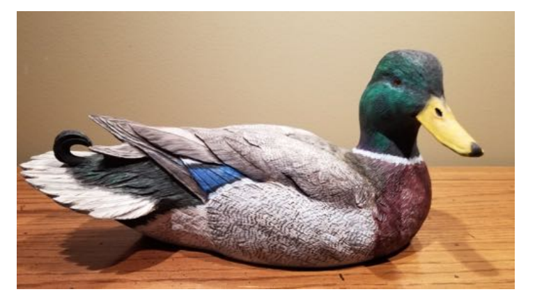
Full Detail Mallard Drake