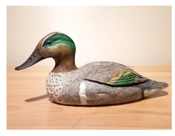
Partial Detail Green WInged Teal Drake