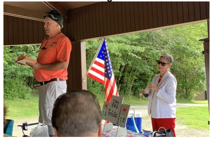
Thanks to Joanne and Linda for some pics

9/27/08 First Model T assembled 9/14/20 First Lincoln assembled 9/9/54 First production 55 TBird Assembled 9/19/55 Last production day for 55 TBirds 9/17/56 First production day for 57 TBirds 9/4/57 Edsel goes on sale 9/2/59 Falcon introduced 9/11/70 Pinto goes on sale