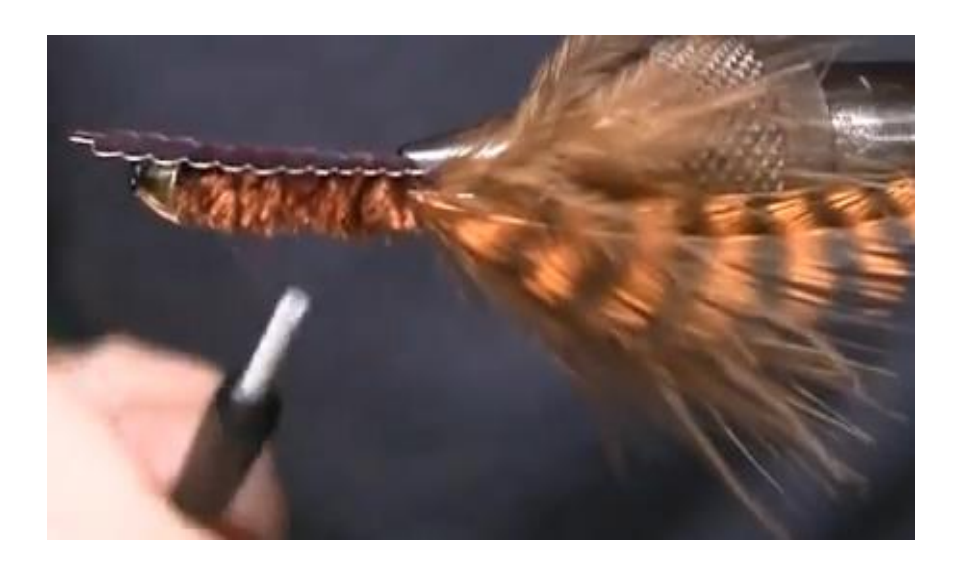
This picture show the tie down of the Bugger Bling.

7. Attach the Kiley's Bugger Bling to each side of the Wooly Bugger. Align the end of the Bugger Bling with the end of the fly. Use two wraps of thread to secure the Bugger Bling behind the cone head. Now repeat for the opposite side and then trim the Bugger Bling as needed at the cone head.