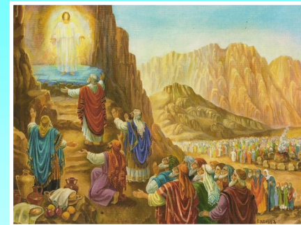
YHVH WITH 70 ELDERS OF ISRAEL

These charts will seek to establish several points of interest. The most prominent ones will be as follows.