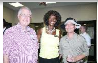
Thanks to the following for donating raffle prizes...