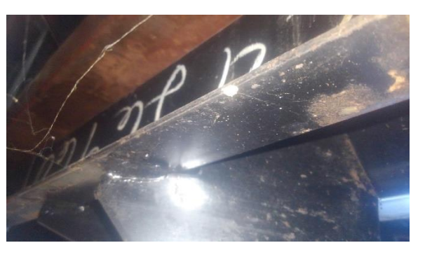
Inside Frame Rail