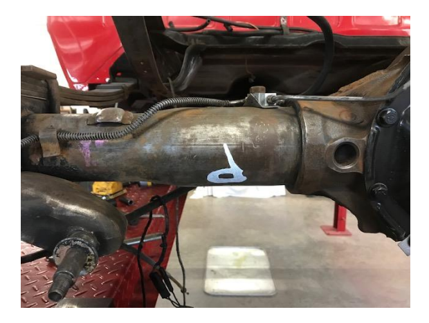
Rear Axle Housing

Below are some examples of the markings.