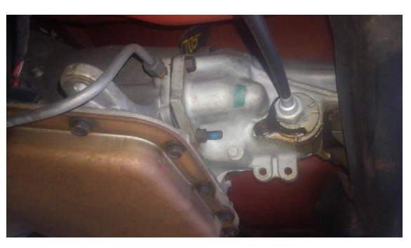
Speedometer Drive Housing