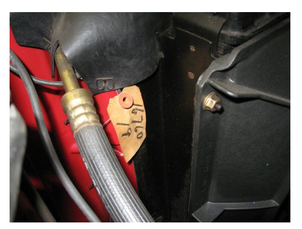
Tag on A/C Line

As you can see, there were quite a few different markings and labels, making it almost impossible to include everyone. The big problem is, all trucks had markings, but not all in the same location or color. This article is just to give you an idea as to some of the colors and locations.