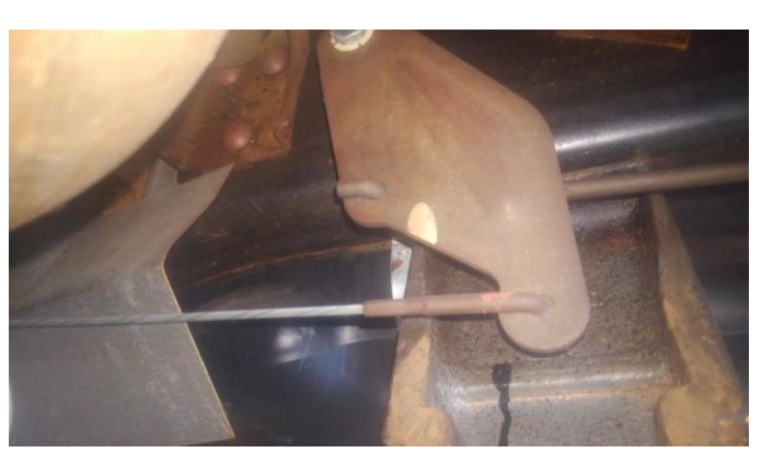
Parking Brake Bellcrank