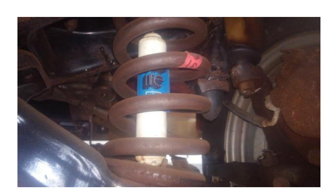
Label On Front Spring

There were also many more crayon and paint markings along with numerous other tags and labels at different locations.