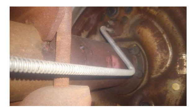
Rear Axle Housing