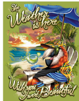
WISH YOU WERE BEAUTIFUL

BarRags is discontinuing some designs to make room for new designs for 2017.