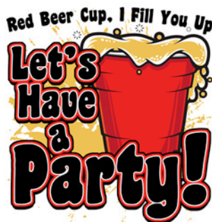
RED BEER CUP