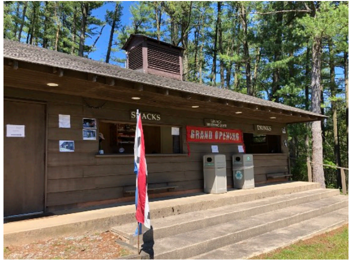
Legacy Trading Post open for business