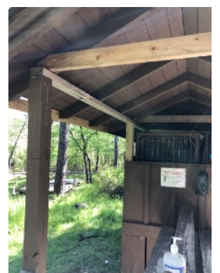
Repair work on the Dan Beard washstand