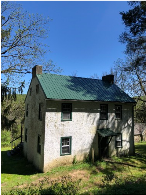
New roof on the White House.