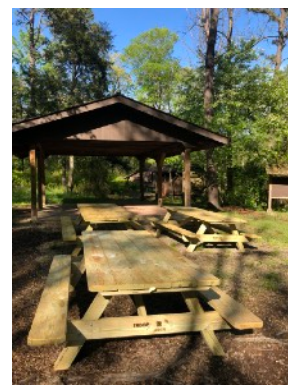
Picnic tables delivered to camp