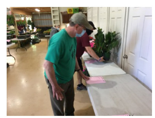
Troop Meeting Friday May 21, 2021

Practice continues for the upcoming Field Day. Attendance at the meetings has been fantastic as the weather improves and the days get longer.