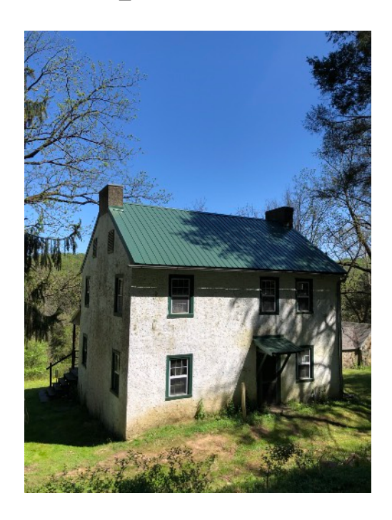
New roof on the White House.