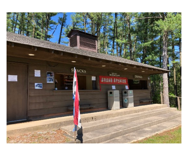
Legacy Trading Post open for business