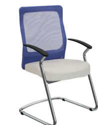
TA-L-6 A : 19 1 / 2 " C : 18" E : 19"

• Not shown above : Models TA-H-2, TA-H-3, TA-H-4, TA-H-6 with 24" backrest height