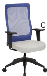
TA-D A : 19 1 / 2 " C : 17 1 / 2 " - 22 1 / 2 " E : 26 1 / 2 "