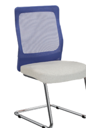
TA-L-2 A : 19 1 / 2 " C : 18" E : 19"