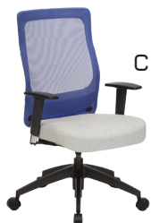
TA-H A : 19 1 / 2 " C : 17 1 / 2 " - 22 1 / 2 " E : 24"