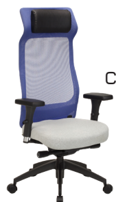
TA-E A : 19 1 / 2 " C : 17 1 / 2 " - 22 1 / 2 " E : 33"