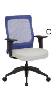
TA-L A : 19 1 / 2 " C : 17 1 / 2 " - 22 1 / 2 " E : 19"