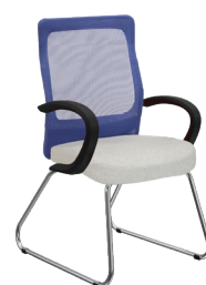
TA-L-3 A : 19 1 / 2 " C : 18" E : 19"