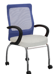
TA-L-4 A : 19 1 / 2 " C : 18" E : 19"