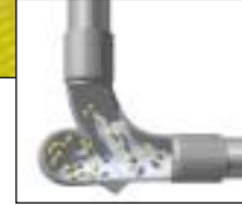
*please call for complete details.