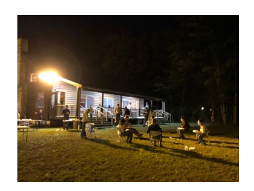
Field Day and Eagle Court of Honor

Field Day Part 1 Friday October 9, 2020 By Ethan Winkleman