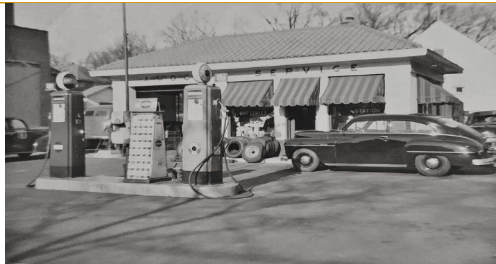
Rutherford NJ date unknown