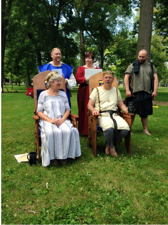
Start of Court