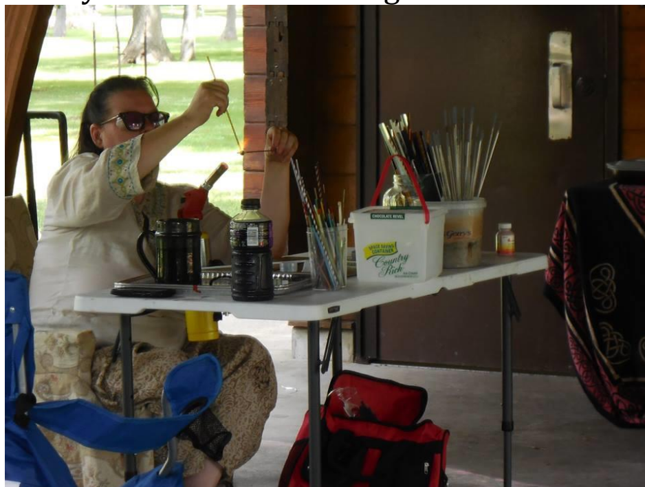
Court Photos courtesy of Xanthippe: