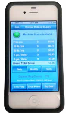
Our Remote Access Monitoring System as seen on an iPhone.

Cashless Vending Technology: It is well known that Americans are using credit and debit cards to make their purchases. It's about convenience! Numerous studies have shown that adding the option of the Credit/Debit Card Reader allows owners to raise pricing with better consumer tolerance, to win new business, and to increase overall sales.