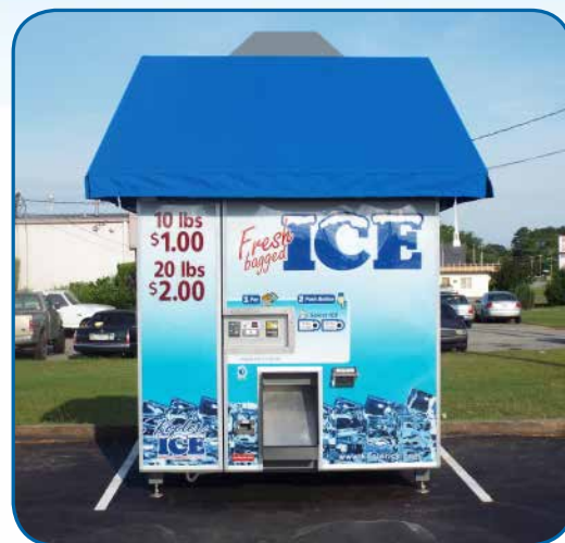
The IM2500 Series II has the highest production with the smallest footprint available in the industry today.

All of our machines comply with the new ADA requirements for consumer accessibility and, additionally, are NAMA certified and listed as complying with the federal guidelines for sanitation and consumer safety. Our machines are also ETL certified to UL541 standards for refrigerated vending machines to provide added safety for the owner and the consumer. And because the IM2500 Series II is considered a vending machine and has these important certifications, it is much easier to permit than a modular house that is considered a permanent structure.