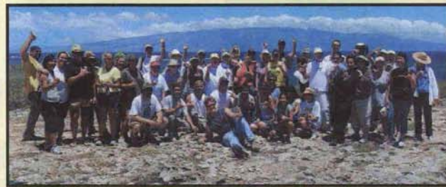
Pau hana time for this work crew ... time to head for the beach!