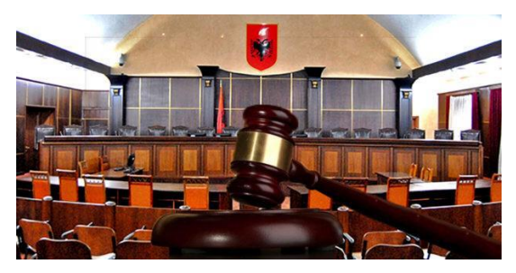
The Albanian Supreme Court

after President Ilir Meta appointed four new members on Friday. The Court now has 7 of its 19 judges, but it can handle all cases with a quorum of 5 judges, except for appointing members to the Constitutional Court. (www.exit.al)