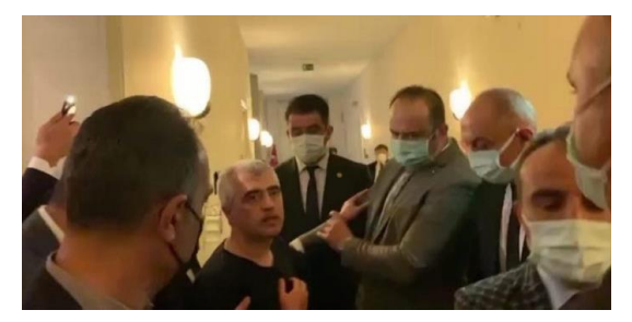
HDP MP Omer Faruk Gergerlioglu

- March 21<sup>st</sup>, Turkish Police detained pro-Kurdish lawmaker Omer Faruk Gergerlioglu from his party's headquarters in Parliament, where he had been staying for four nights to protest against the stripping of his MP status over a separate case. (www.aljazeera.com)