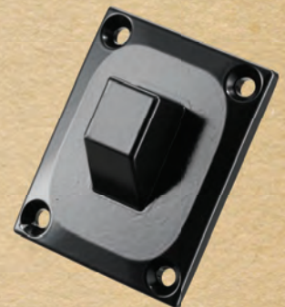
Universal Mounting Bracket