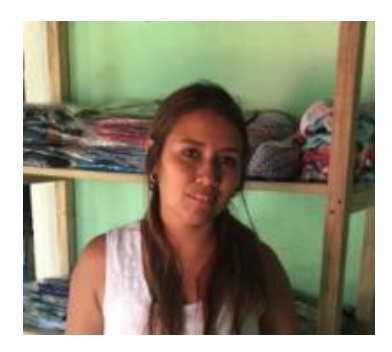
Lenora House is all funded! Praise the Lord! Please pray for her health.